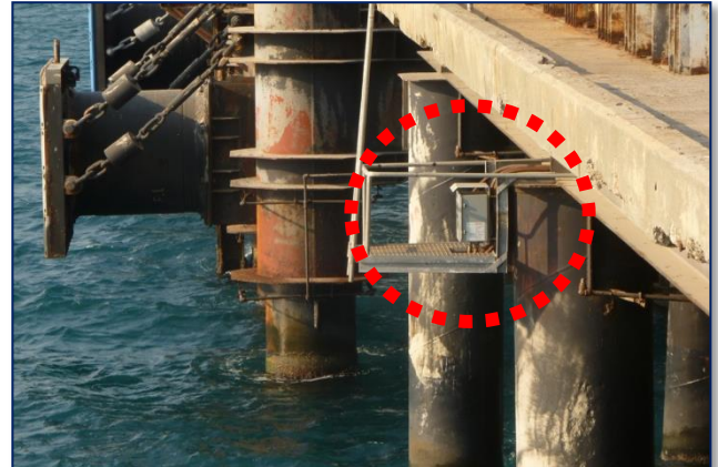
Application Example: Marine Oil Terminal

The Slick Sleuth oil spill detection system delivers significant cost reduction and environmental benefits to operators with its reliable, all-weather, non-contact and low maintenance technology.