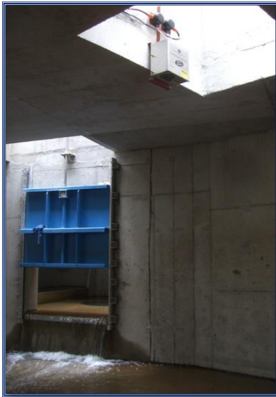
Underground Effluent Discharge Monitoring Application