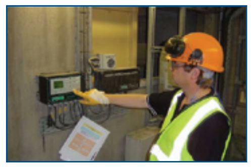
PCME systems allow the safe examination of the filter either at the control unit or remotely via a PC