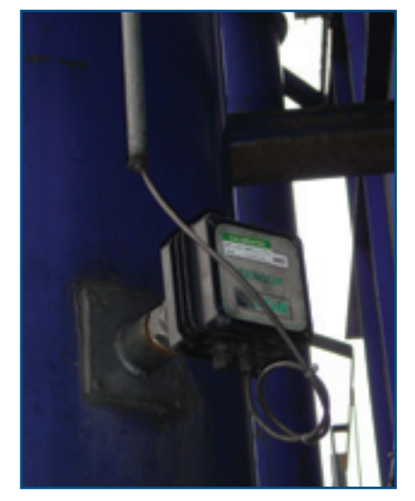
Electrodynamic Sensor installed in bag house outlet

Reduced environmental emissions due to better filter control