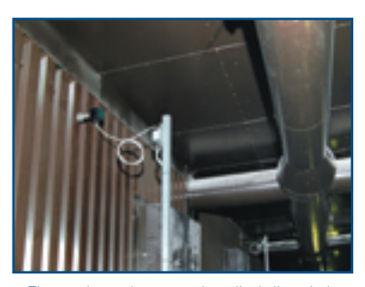
Electrodynamic sensor installed directly in Baghouse compartment wall

Employing Electrodynamic trending sensors in each compartment of a multi-chamber bag house allows plant operators to observe the real-time changes in base line emissions and to have instantaneous, plant-wide access to the functionality of their filter systems.