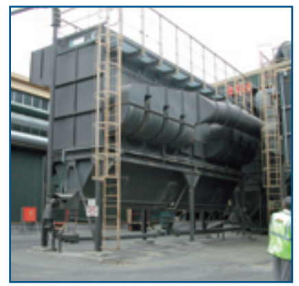
Bag House control enhanced by Electrodynamic filter management

Although particulate monitoring systems are generally purchased to monitor environmental emissions to atmosphere, many users also utilise these instruments as preventative maintenance tools.