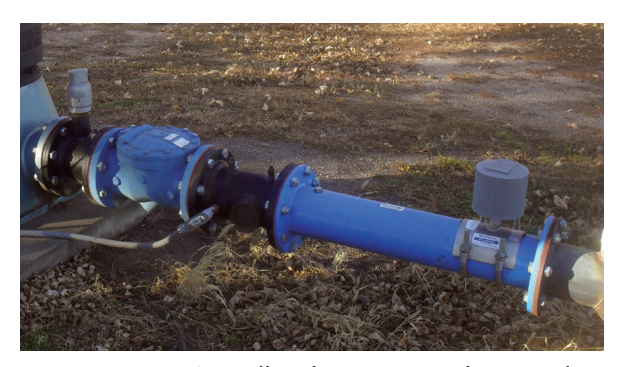
Figure 4: Mc Propeller Flow Meter With Integral Flow Straightener Installed At A Pump Station

Standard features include a six-digit totalizer and instantaneous flow rate indicator. Its unique design makes it easy to install and service in the field. The McCrometer flow meter is a water management tool that helps to reduce overall water usage, allowing for improved management of water resources in areas such as the Republican River Basin where conflicts have arisen between various water users.