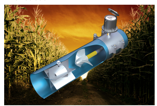
Figure 2: Mc Propeller Flow Meter With Integral FS100 Flow Straightener

Lubeck and his staff at the LRNRD contacted McCrometer about a new solution after the LRNRD board decision. A world leader in flow measurement for agricultural irrigation since 1955, the applications team at McCrometer suggested the McCrometer Mc Propeller Flow Meter with an integral FS100 Flow Straightener. The integral flow straightener eliminated the previous straight-run installation problem, and the Mc Propeller meter's mechanical register operates whenever water passes through the meter's propeller assembly . . . it's always on and measuring flow.