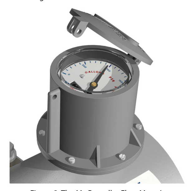
Figure 3: The Mc Propeller Flow Meter's Mechanical Register

Lubeck and his staff at the LRNRD contacted McCrometer about a new solution after the LRNRD board decision. A world leader in flow measurement for agricultural irrigation since 1955, the applications team at McCrometer suggested the McCrometer Mc Propeller Flow Meter with an integral FS100 Flow Straightener. The integral flow straightener eliminated the previous straight-run installation problem, and the Mc Propeller meter's mechanical register operates whenever water passes through the meter's propeller assembly . . . it's always on and measuring flow.