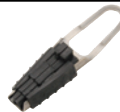
Cable clamp Art. no. 20636