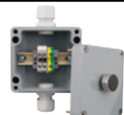
Junction Box FMD(IP67) Art. no. 20069