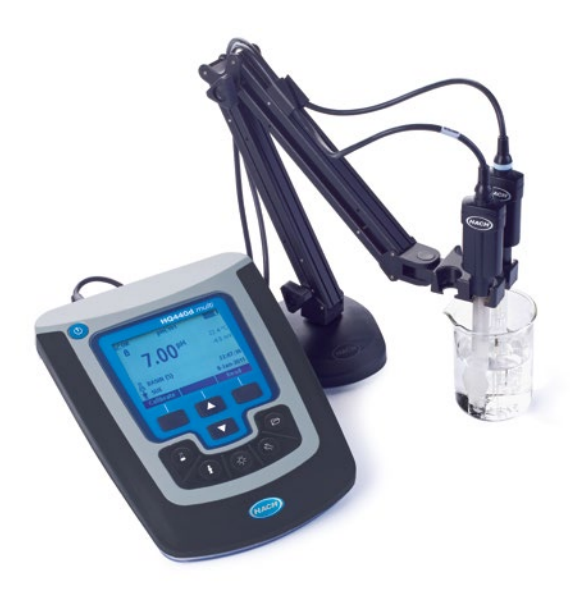
HQD benchtop multi-meter