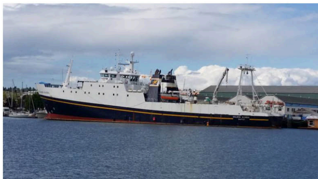
Golden Alaska

The 305-foot factory trawler f/v Golden Alaska is powered by twin MAK six-cylinder engines and has a large boiler used to support large fishmeal-fish oil processor and hoteling galley needs of the 130-person crew and factory personnel.