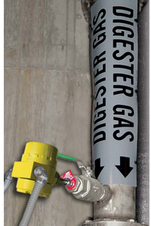
Figure 5: Flow meter installed on digester gas pipeline

Methane digester gas is a natural by-product of WWTP processes and will continue to require the attention of process and plant engineers at wastewater treatment plants. Whether flared or harvested as fuel gas, methane and other digester gases will be measured, monitored and controlled one way or another. Accurate measurement of methane and other digester gases is critical to all of these processes, and thermal mass flow meters with constant power technology from FCI provide high accuracy, low maintenance, long-life instrument solution designed for this purpose. (Figure 5). ■