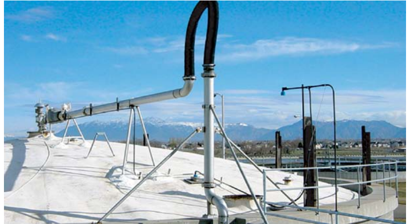
Figure 2: Typical WWTP digester tank and flare gas process loop

Thermal dispersion type mass flow meters feature a wide-turndown ratio—typically up to 100:1, but some up to 1000:1-- and are highly sensitive to low flow gas measurement. They have no moving parts and their insertion probe design is easy and low cost to install. In addition, they are preferred