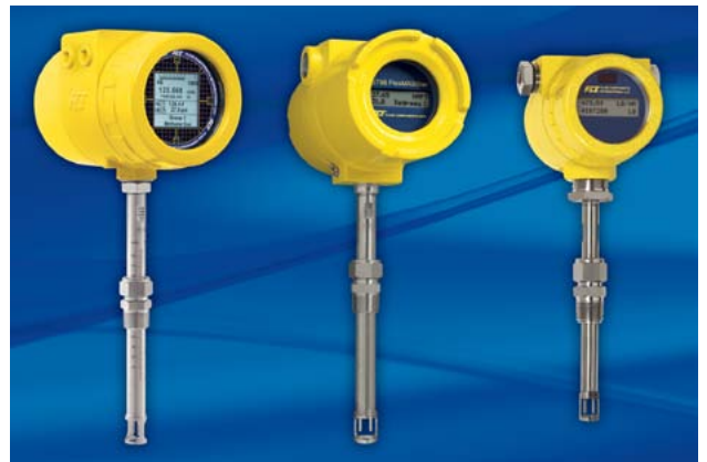
Figure 3: ST100 Series flow meters

by plant engineers for digester applications because their no moving parts designs makes them highly resistant to clogging or fouling by the dirty residue and condensates present in this environment.